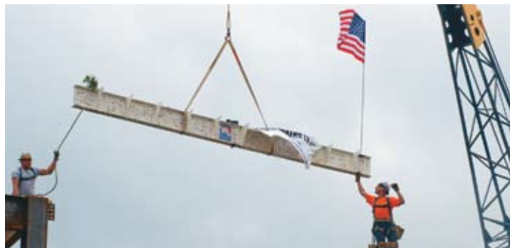
Construction workers guide the beam topping off the new Business and Engineering Center into place.

Expansion of the Recreation and Fitness Center is nearing completion. A 44,000-square-foot addition doubling the facility's space will open in the fall.