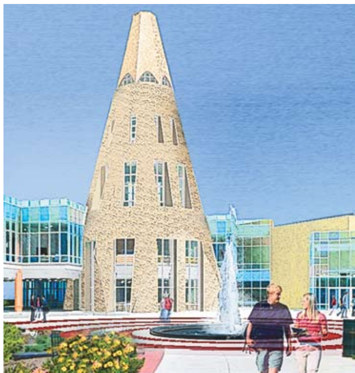
A conical-shaped tower will serve as entrance to the expanded University Center.